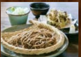
Katashina Maitake mushroom tempura and handmade Nihachi soba noodles