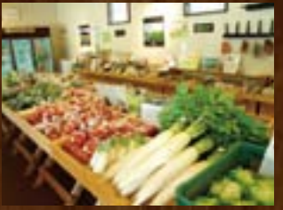
Direct sale of local farm products