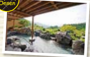
1 Hanasaku Onsen Hana no Eki Katashina / Hanasaku no Yu TEL.0278-20-7111

Onsen on a plateau with water welling from the base of Hotakayama.