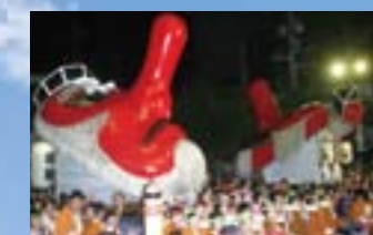
Numata Matsuri Festival / Dai-tengu Mikoshi

This road covers 320km in total, from Ueda City to Karuzawa in Nagano, then Kusatsu, Numata City and Katashina Village in Gunma, then to Nikko City in Tochigi. A great many romantic poets in Japan have written about this road, and from the fact that its views are the most similar in Japan to German landscapes, it was renamed in the style of the Romantic Road in Germany. It has been a sister road to the German Romantic Road since November 1988.