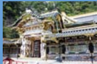
Nikkō Tōshō-gū Shrine Karamon Gate